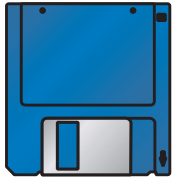
DISKETTE PC FORMAT