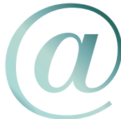
VIA E.MAIL PC FORMAT