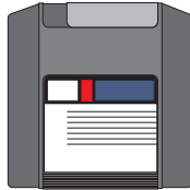
ZIP 100 PC FORMAT